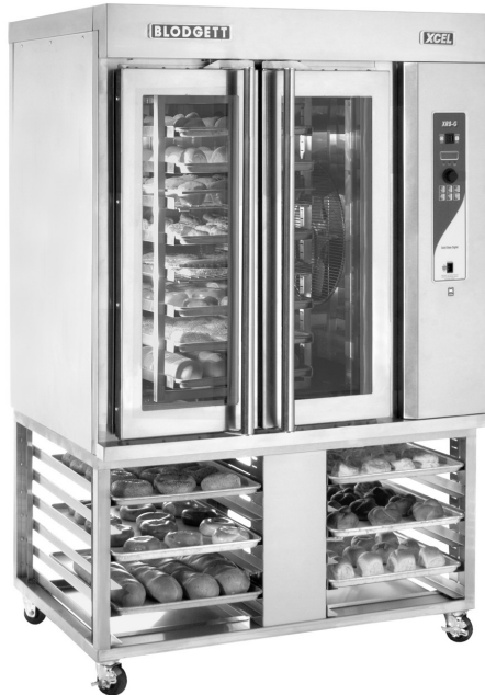
XR8-E with 12 pan stand