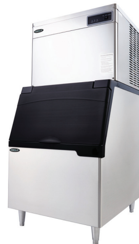
Bin KB-350 shown above is not included - sold separately