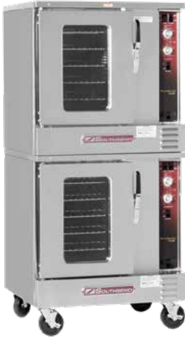
GH/20SC shown with optional casters