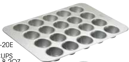
HMF-20E 20 CUPS LARGE 8.2OZ