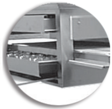
Removable panels for easy cleaning