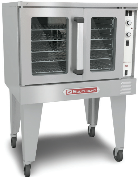
SLGS/12SC shown with optional casters

OPTIONAL NRG System required for rebates. NRG System units are Energy Star Approved. (Standard Depth Only)