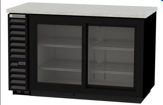
BB58HC-F-GS-1-B (Black model shown)