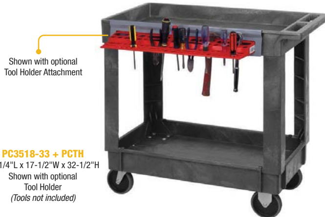
Shown with optional Tool Holder Attachment