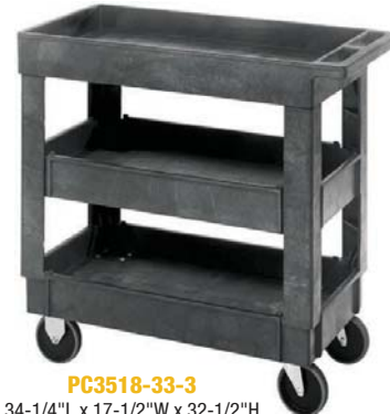
PC3518-33-3 34-1/4"L x 17-1/2"W x 32-1/2"H