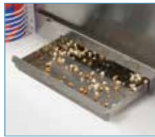
Old maid drawer catches unpopped kernels