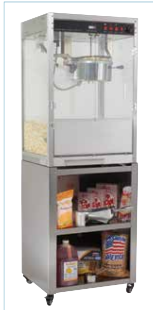
Convenient storage compartment on service side