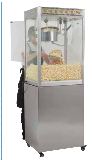
Plenty of storage space