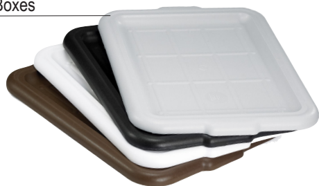
1531BR 1531W 1531B 1531G