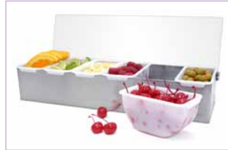
CDP-6 shown filled