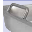
Patented handle system