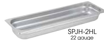
SPJH-2HL 22 gauge