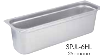
SPJL-6HL 25 gauge