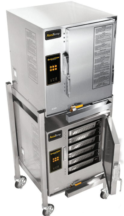
E6 Evolution™ models shown double-stacked on stand with casters

Evolution™ steamer is AccuTemp Products' electric, connected, boiler-free steamer that utilizes AccuTemp's patented Steam Vector Technology™ for faster cook times, improved energy efficiency, better pan-to-pan uniformity, and less water consumption. Steam Vector Technology utilizes no moving parts inside the cooking chamber. Steam is produced inside the cooking cavity with no heating element exposed to water. Certified holding cabinet. Easily connects to water and drain line. Uses less than 1 gallon of water per hour. Steamer includes low water, high water, over-temp warning lights and auto shut off feature. Evolution includes heavy duty, one-piece field reversible door. Standard digital controls with independent timer. No water quality exclusions in warranty. No water filtration or treatment required. Lifetime Service & Support Guarantee. Steamer is UL Safety and Sanitation Certified, and ENERGY STAR® qualified. Made in the USA.