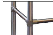
94 Series Adjustable Side & Front Cross-Bracing