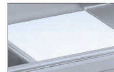
Recessed Bowl Surface Accommodates Poly-Vance Cutting Boards & Sink Covers