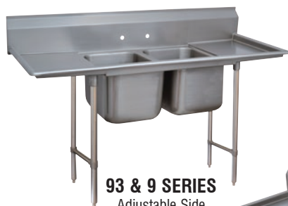
93 & 9 SERIES Adjustable Side Cross-Bracing