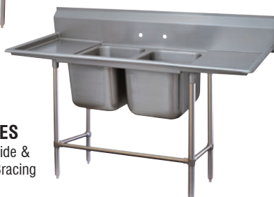
94 SERIES Adjustable Side & Front Cross-Bracing