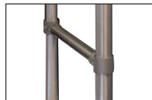
93 & 9 Series Adjustable Side Cross-Bracing