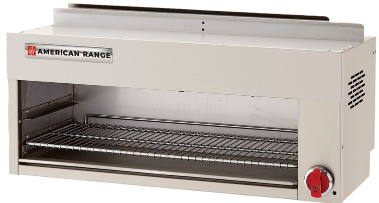
Model Shown ARCM-36