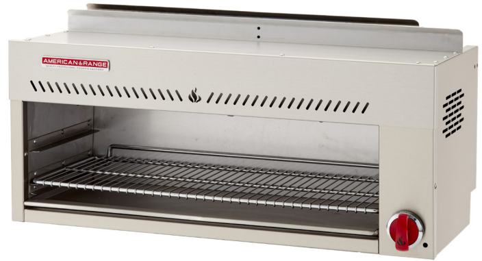
Model Shown ARCM-36