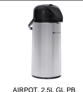
AIRPOT, 2.5L GL PB SINGLE PK