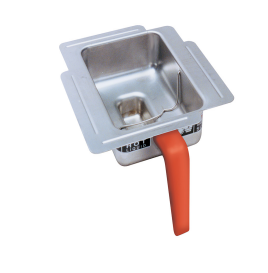
FUNNEL ASSY,SST-PP ORANGE HDL