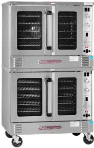
BES/27SC shown with optional casters