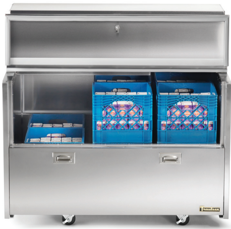
Model Shown - RMC49D4