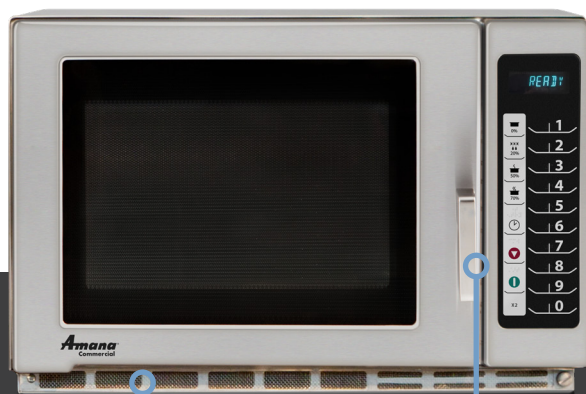
Cleanable air filter removes easily