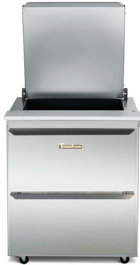
32" WIDE MODELS TOP RAIL/DRAWER CAPACITY UST3212-D (12) / (8) in Top & Bottom