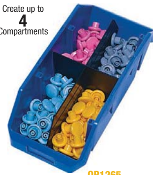
QP1265 Shown with optional Dividers CD1265/LD1265