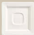
5" Square Saucer w/well ring No. SL-2 H 3/4 WL 2 3 doz./23# • .5 cu. ft.