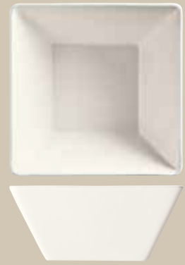
9 1/4" - 100 oz. Square Bowl No. SL-99 H4 1/8 6 pcs./26# • 1.0 cu. ft. Fits Versa-Riser No. VR-3