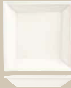
9 7/8" - 30 oz. Square, Pasta Bowl No. SL-14 H1 1/2 1 doz./33# • .8 cu ft