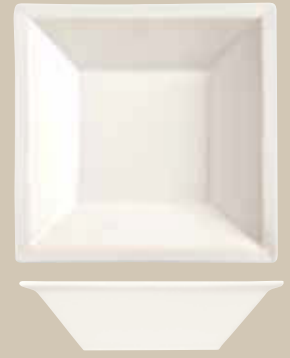
11" - 80 oz. Banquet Bowl No. SL-80 H3 6 pcs./28# • 1.4 cu. ft.