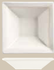
7" - 12 oz. Square, Grapefruit No. SL-12 H1 1/2 2 doz./31# • .6 cu ft