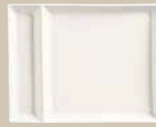
9" x 7" Plate, Cocktail No. SL-900 H1 1/8 2 doz./33# • .7 cu. ft. Also shown on page 60