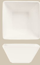
5 1/2" - 20 oz. Square Bowl No. SL-19 H2 3/8 2 doz./29# • .8 cu. ft.