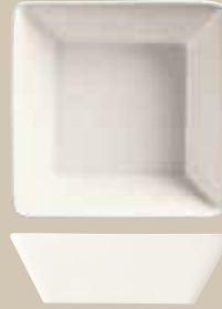
8" - 50 oz. Square Bowl No. SL-50 H2 1/2 1 doz./31# • .9 cu. ft. Fits Versa-Riser No. VR-3