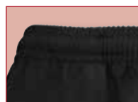
Elastic drawstring waist