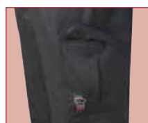
Cargo pockets with velcro closure