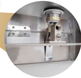
KNEE ACTIVATED FAUCET WITH HINGED FRONT APRON