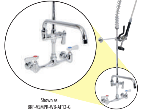
Shown as BKF-VSMPR-WB-AF12-G