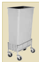
Fits most standard slim trash cans