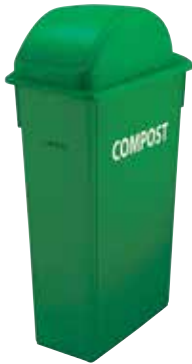
PTC-23GRC & PTCL-23GR