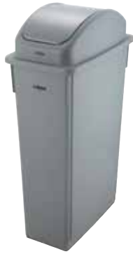
PTC-23SG & PTCL-23