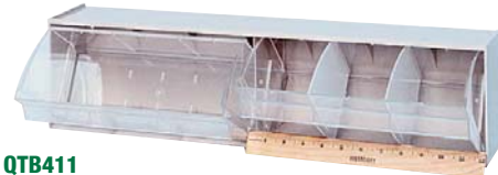
QTB411 QTB411 is a two bin design, each bin 12" wide Each QTB411 comes with 6 DIV400 clear dividers*