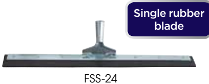
Single rubber blade