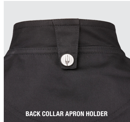
BACK COLLAR APRON HOLDER