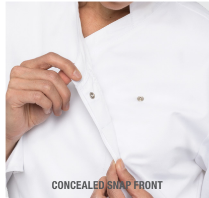
CONCEALED SNAP FRONT