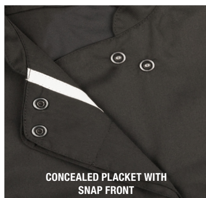
CONCEALED PLACKET WITH SNAP FRONT