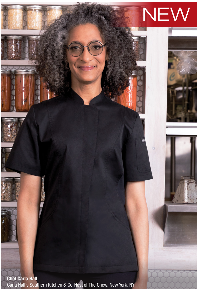
Chef Carla Hall Carla Hall's Southern Kitchen & Co-Host of The Chew, New York, NY