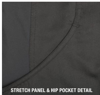
STRETCH PANEL & HIP POCKET DETAIL