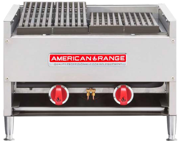
Model Shown AECB-24