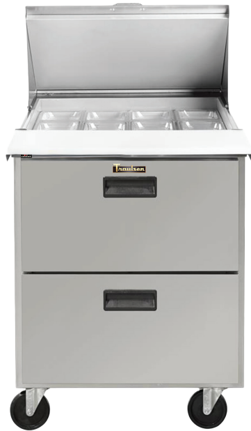
27" WIDE MODEL CLPT-2708-DW