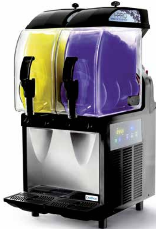
Model I-PRO 2E