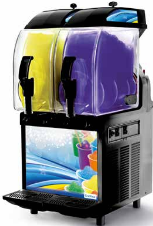
Model I-PRO 2M with light panel