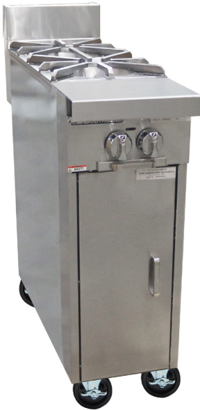
Model P12C-B with optional 24" flue riser