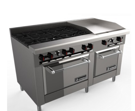
Model R60 2ST - 36B 24G

100% manufactured from raw materials providing the highest quality and durability