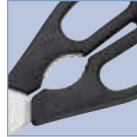
Built-in cracker or bottle cap grip