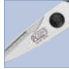
Built-in bottle cap opener