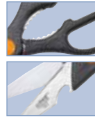
Built-in cracker and bottle cap opener