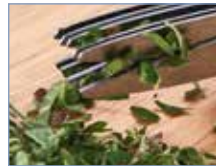
Cut, chop, mince herbs