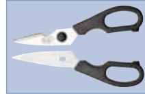
KS-06 is detachable