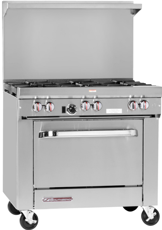
S36D (shown with optional casters)