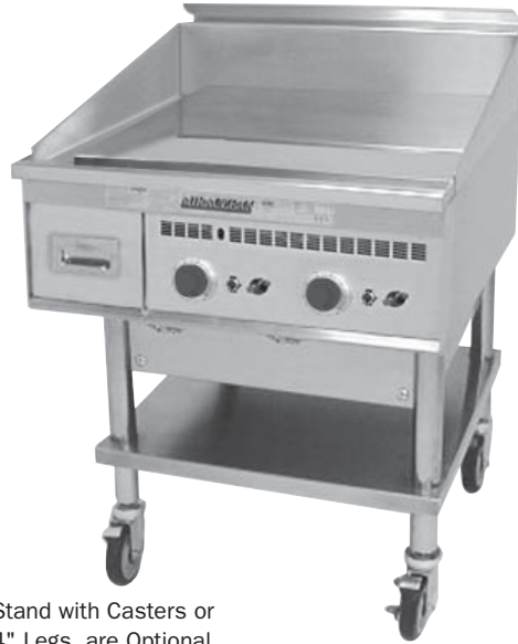
Stand with Casters or 4" Legs are Optional

The Keating MIRACLEAN® Griddle is designed to provide maximum performance with many benefits to the operator. The mirror surface is achieved in a special eight step process. High input burners rated at 30,000 BTU/hr. for natural gas are mounted every 12" to ensure performance and recovery allowing the operator to use zone cooking for different products.