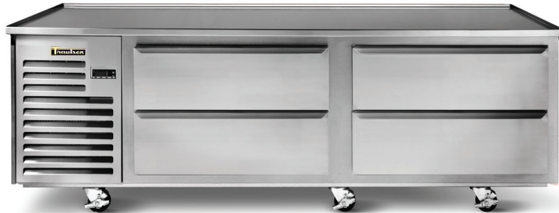
Representative, 4-drawer model shown