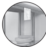
TA-77 Check Minder Provision On Any Shelf

Load Capacity = 20 lbs. per sq. ft. (Evenly Distributed Weight)