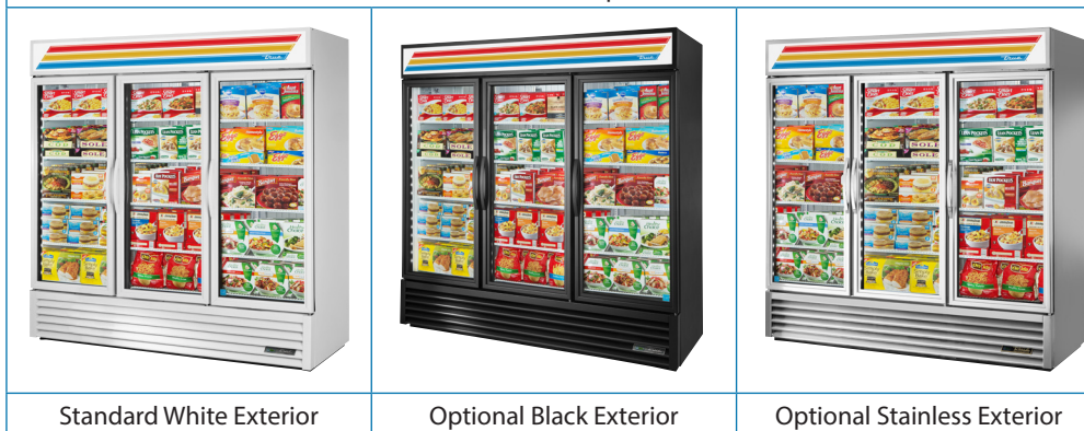
Standard White Exterior