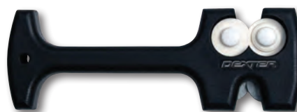
07921 EDGE-2 2-stage hand held knife sharpener