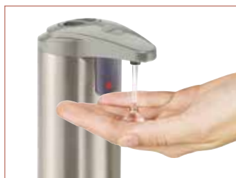
4-level adjustable dispensing volume