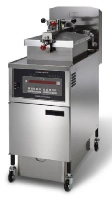
PFE 561 electric pressure fryer with Computron<sup>™</sup> 8000 control

Henny Penny first introduced commercial pressure frying to the foodservice industry more than 50 years ago. Frying under pressure enables lower cooking temperatures for longer oil life, and faster cooking times to meet peak demand. Pressure also seals in food's natural juices and reduces the amount of oil absorbed into product.