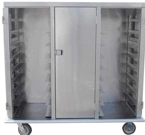
TC-27 Shown w/ Wrap Around Bumper