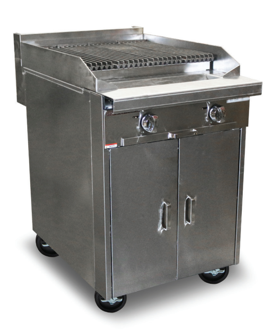
Model P24C-CC shown with optional casters