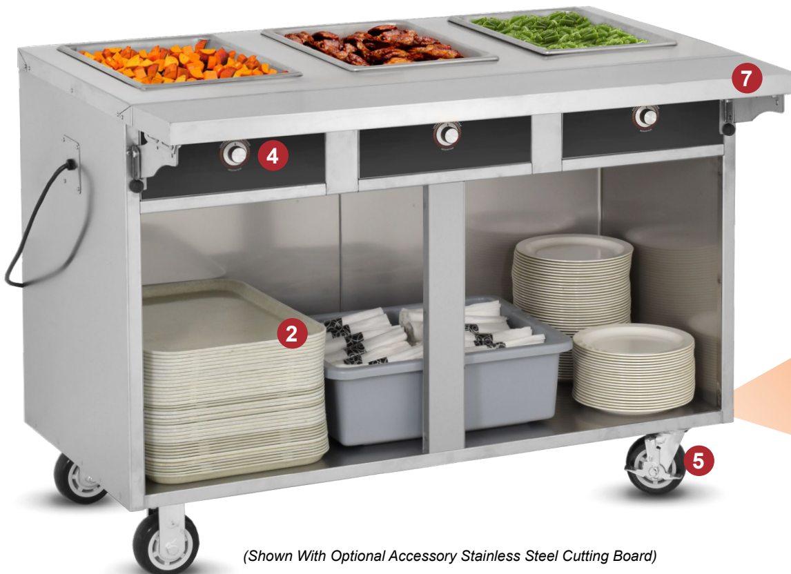
(Shown With Optional Accessory Stainless Steel Cutting Board)