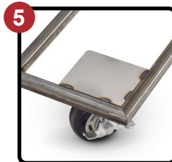
Built for Transport