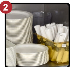
Open Base for Storage