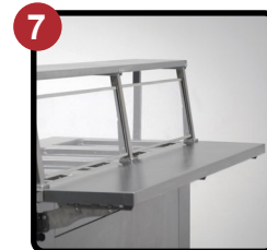
Optional Sneeze Guard & Tray Shelf