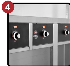
Independently Controlled Wells