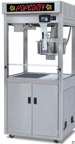
2011 (811) 36" Unit