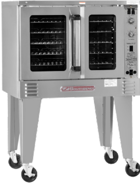
PCG50S/S shown with optional casters