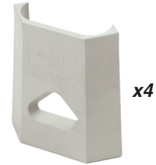
Replacement MetroMax i Wedges Cat. No. MX9985 Bag of 4 wedges